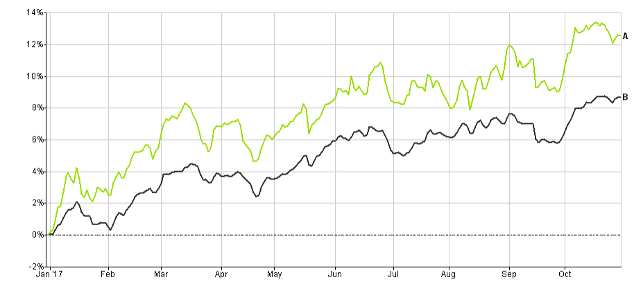
■ A - FP - 8AM Focused A in GB [12.55%] ■ B - UT Flexible Investment TR in GB [8.70%]

Source: Financial Express to 31.10.17. Sector is the UT Flexible Investment.