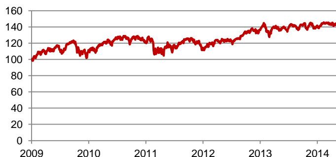
5 Year Performance