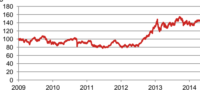
5 Year Performance

Source for company descriptions and historical prices, Bloomberg, as of 8 August 2014. Charts are indexed at 100 starting on 2 January 2008