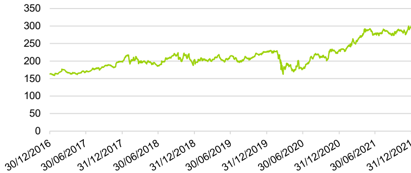
Berkshire Hathaway Inc

Berkshire Hathaway Inc. is a holding company owning subsidiaries in a variety of business sectors. The Company's principal operations are insurance business conducted nationwide on a primary basis and worldwide on a reinsurance basis. Berkshire's other operations include a railway company, a specialty chemical company, and an international association of diversified businesses.